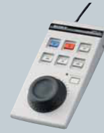
DSRM-10 Remote Control Unit