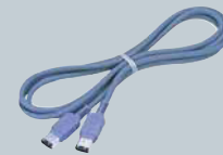
VMC-IL6615B/IL6635B i.LINK cable (6-pin to 6-pin)