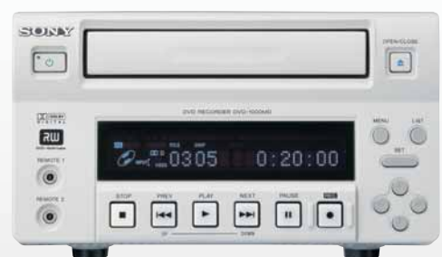
DVO-1000MD Medical DVD Recorder