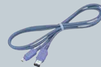
VMC-IL4615B/IL4635B i.LINK cable (6-pin to 4-pin)