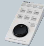
SVRM-100A Remote Control Unit